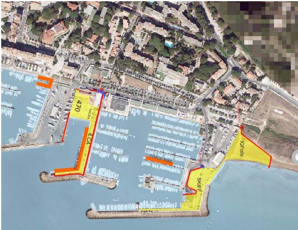
Location of the Base Nautique Municipale - Click here