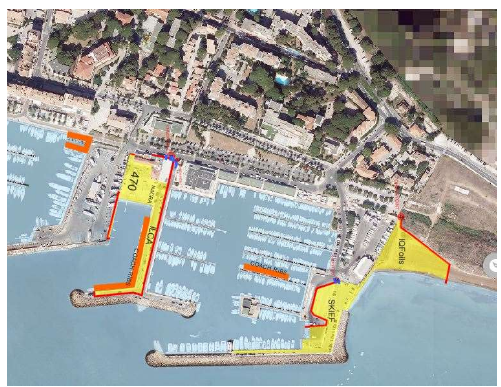
Location of the Base Nautique Municipale - Click here