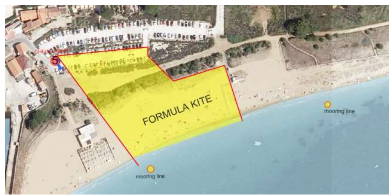
Location of the Kite launching area : Click here